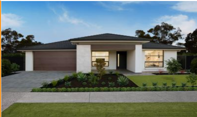
Myrtle Alfresco 27.05 squares

Lot 25 Knappstein Avenue, Roseworthy 'Roseworthy Garden: Flourish'